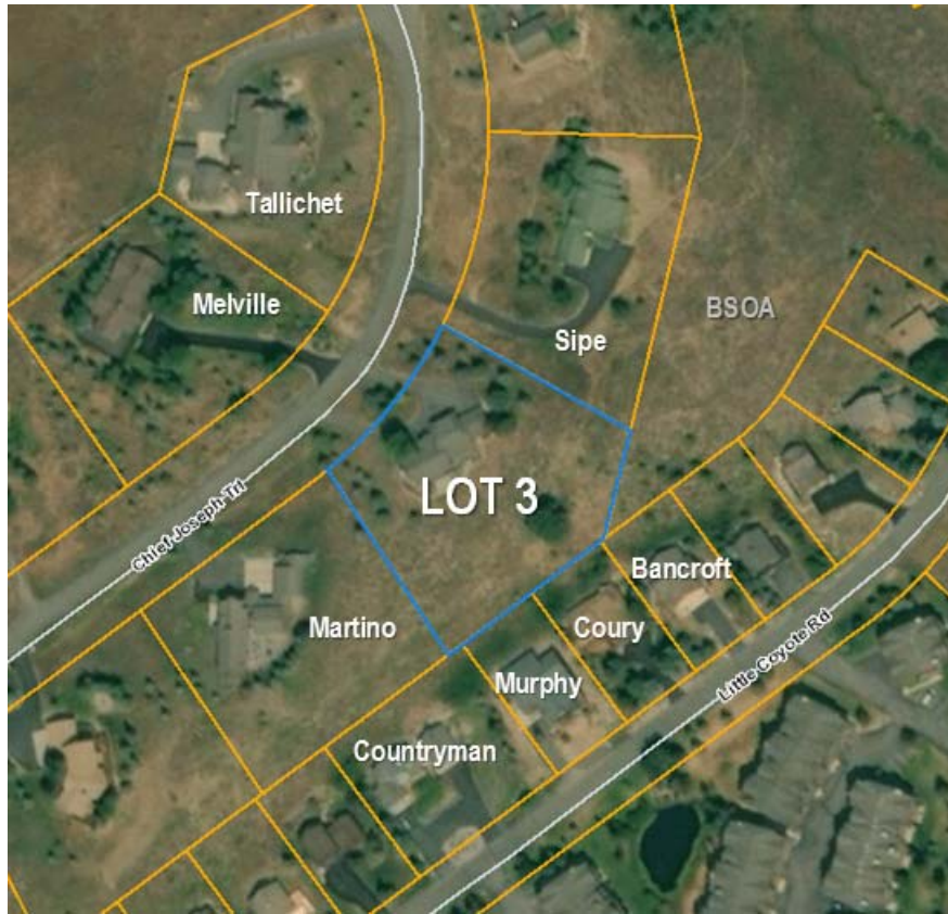
Slade Minor Alterations