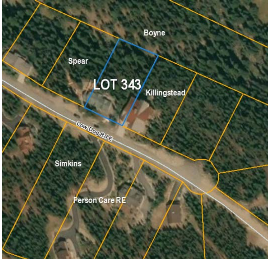
Feigenbaum Minor Alterations