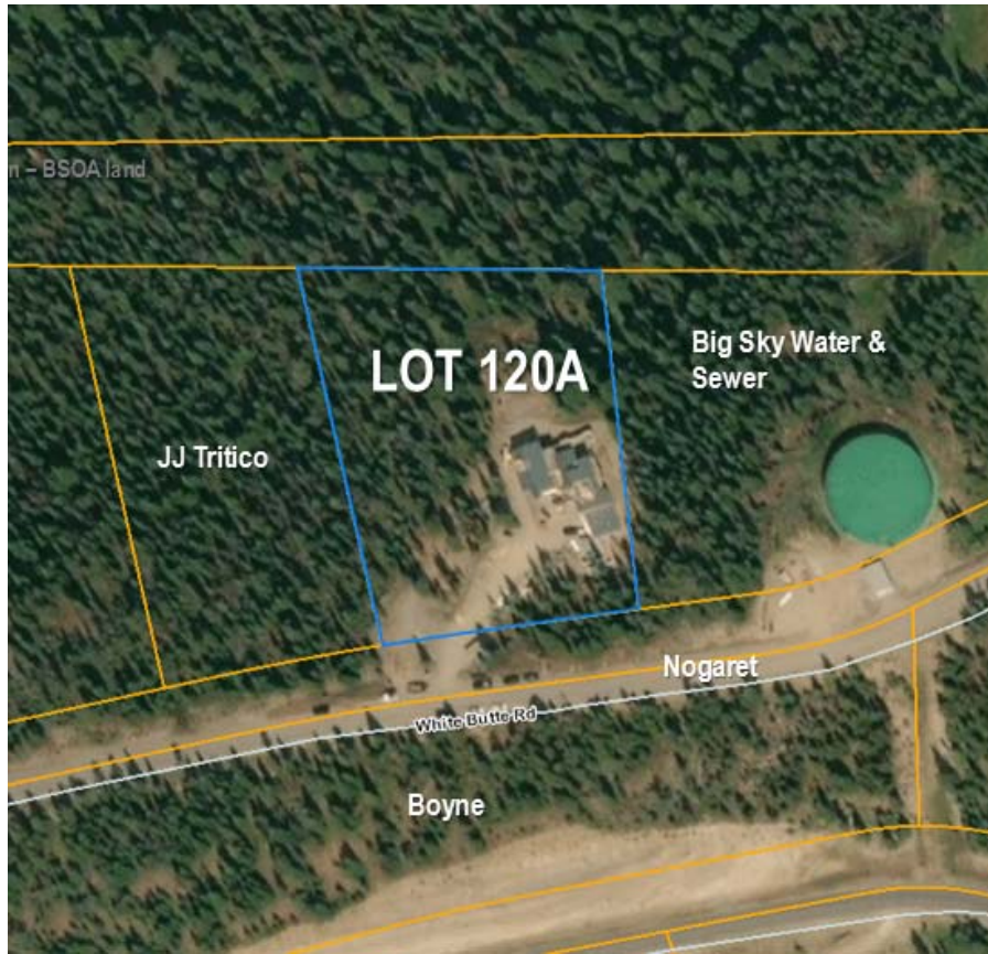
Barr Major Alterations