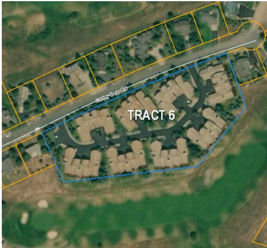
Crail Creek Condos Minor Alterations