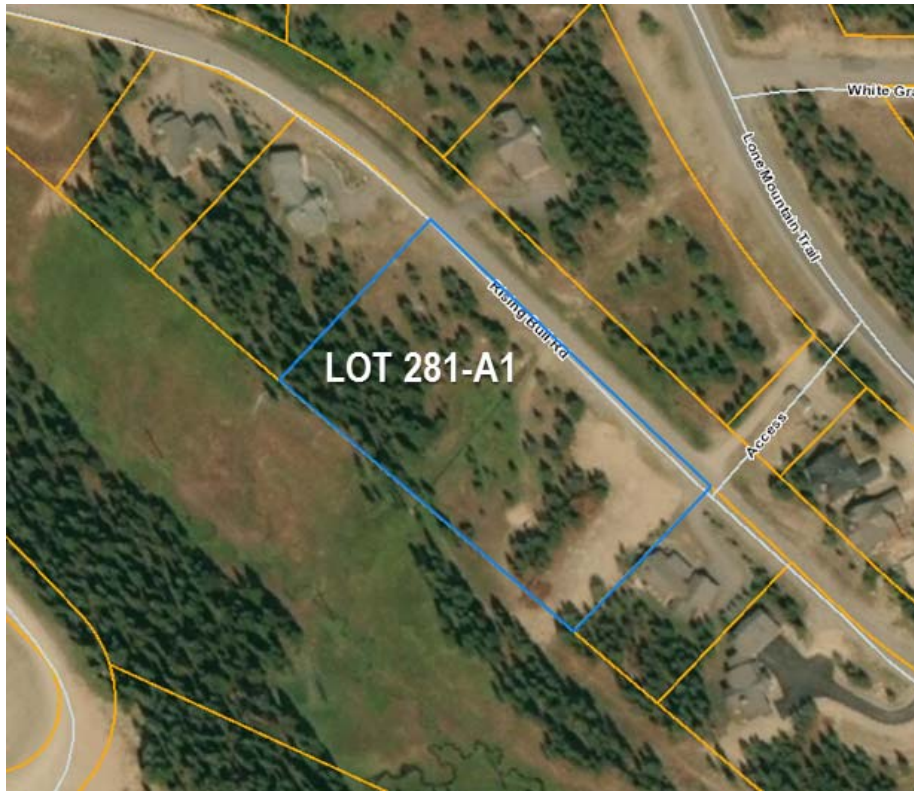
Cascade LLC Variance