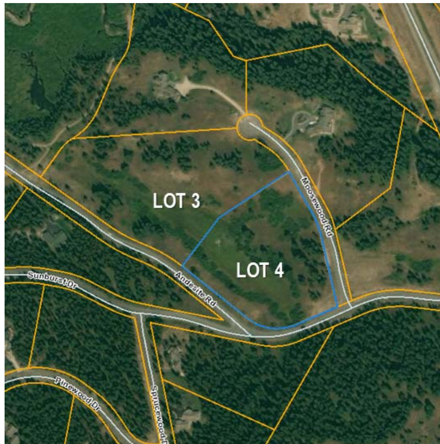
Gillespie/Lee Landscape Alterations