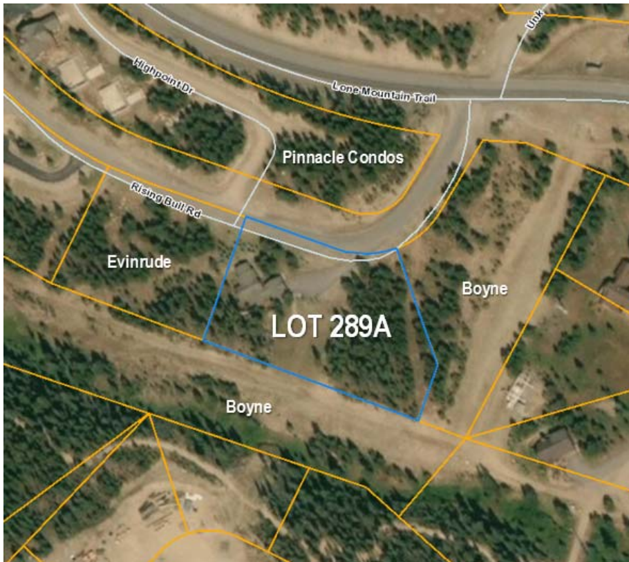
Aspen Grove Partners Minor Alterations