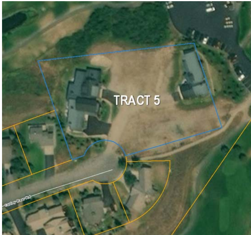
19 th Hole Construction Sign