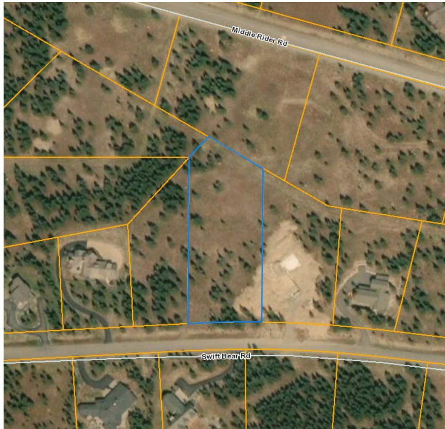
Lodges at Elkhorn Creek Extension request