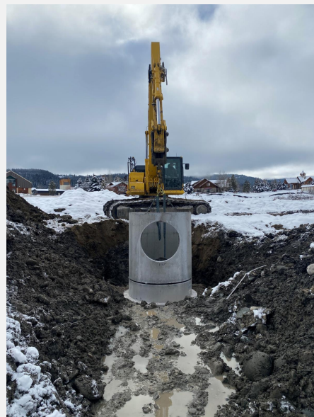
Restoring the stream channel