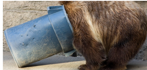
Example of a bear digging through a trash can

Please keep our streets clean, our bears safe, and follow the BSOA Trash Compliance Resolution by taking care of your trash, so Sam doesn't have to. The short version is: wait to put your trash out until the morning of pick-up, take your trash in that same day, and please get bear-safe containers!