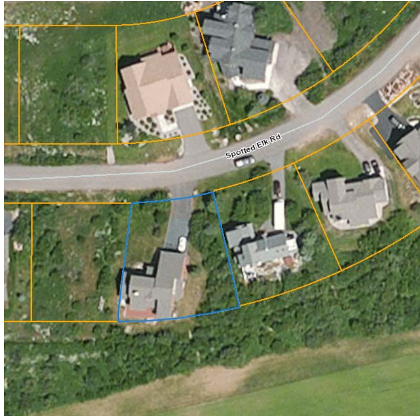
Scott Alteration to Approved Plan