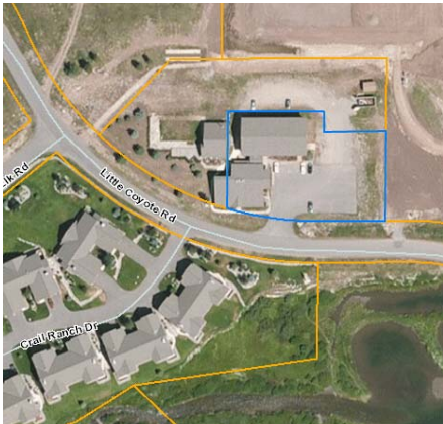
Golden Eagle Minor Alteration

Regularly Scheduled meetings of the BSAC are held at 8A.M. at the BSOA Office in the Big Sky Meadow Village The Big Sky Owners Association • PO Box 160057 • 145 Center Lane • Unit J • Big Sky, Montana 59716