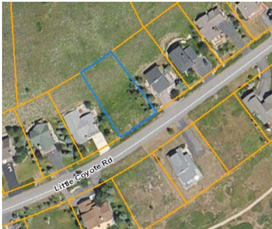
O'Donnell Single Family Residence Final Plan Review

Regularly Scheduled meetings of the BSAC are held at 8A.M. at the BSOA Office in the Big Sky Meadow Village The Big Sky Owners Association • PO Box 160057 • 145 Center Lane • Unit J • Big Sky, Montana 59716