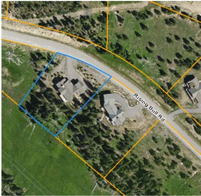
Brown & Appenzeller Minor Alteration