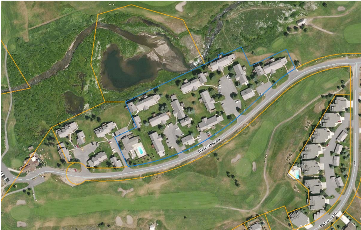
Silverbow #19 & #20 Minor Alteration