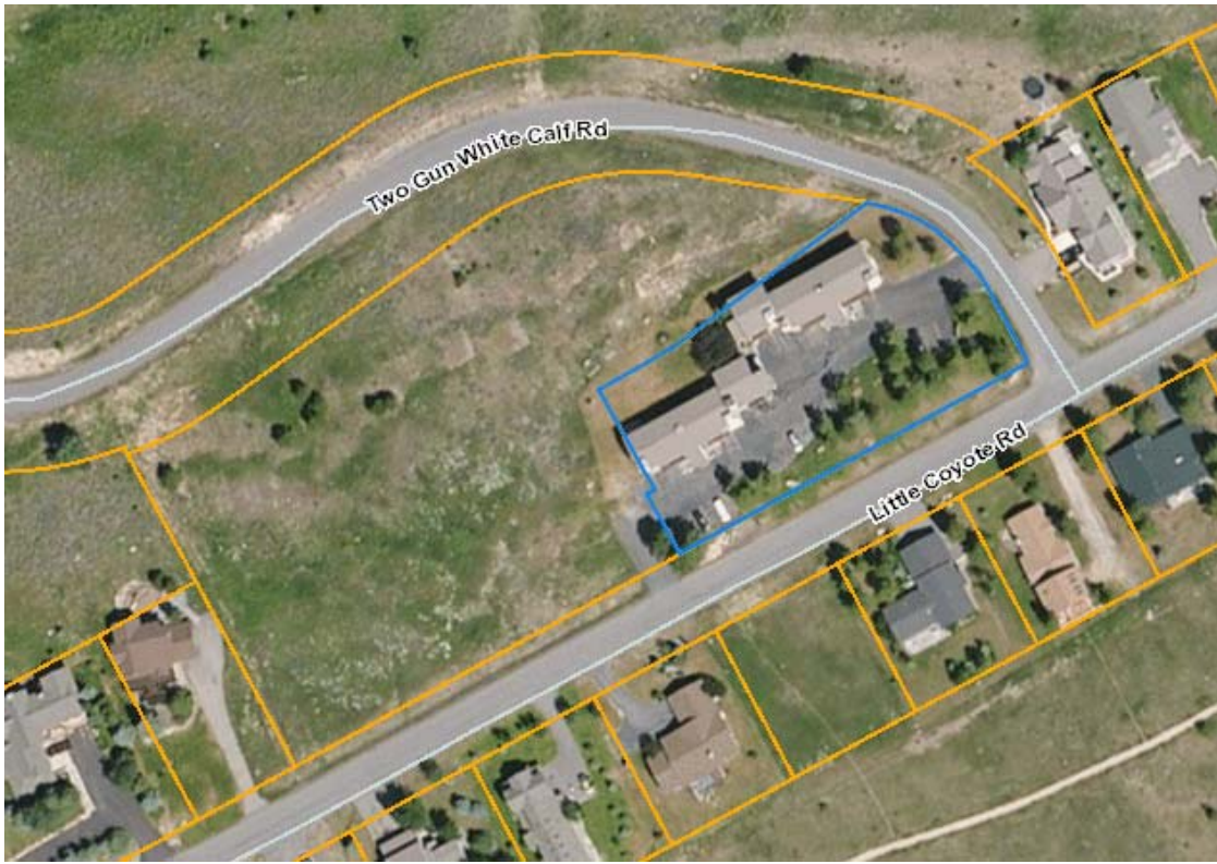
Porter Minor Alterations