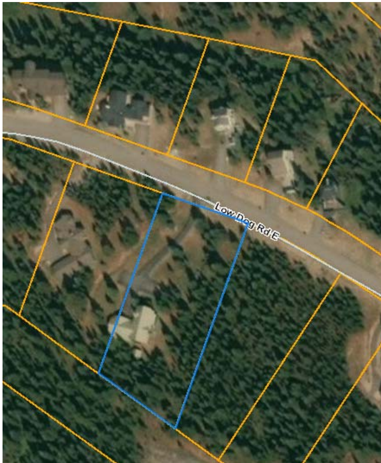
Austin, Glynn & Restaino Landscape Alterations